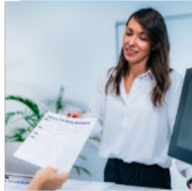
Member Care Team