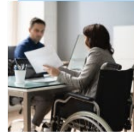
Voice of the Customer Team