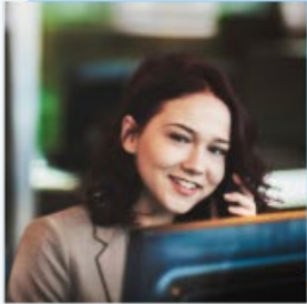
Member Onboarding Team

Ametros has a variety of skilled team members help the injured individual remain compliant with Medicare, while also receiving a level of compassion, care, and support for their post-settlement medical needs